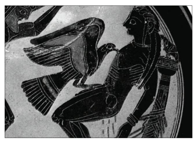
Figure 1: The myth of the Titan Prometheus provides an icon for RegMed<sup>[5]</sup>

its linear transformation and the corresponding causal relationships for the corresponding human response to cancer drugs (regression analysis plus theory). This also includes a comparison of the data collected for cancer immunotherapy. Indeed, to test how well the Bayesian approximation fits with the error function, we can apply Bayesian optimization to the chaos connected with the linear regression of the thought cancer drug experiment. All we need to do is computing the probability function of an objective function — the Root Mean Square Error one. Then we can find the gradient descent with the global minimum. Bayesian optimization builds a probability model of the objective function by: